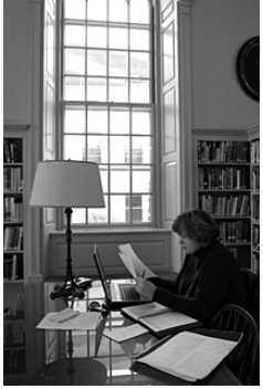
The Bement Room is a comfortable place for working and relaxing

We had a busy and hot summer here at the Stockbridge Library, but thanks to air conditioning we stayed comfortable. Please feel free to stop by to read your favorite newspapers, magazines, or a good book in the comfort of the Bement Room, in any weather, in any season.