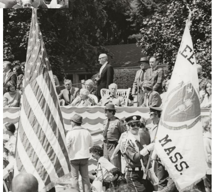
Norman Rockwell on Reviewing Stand